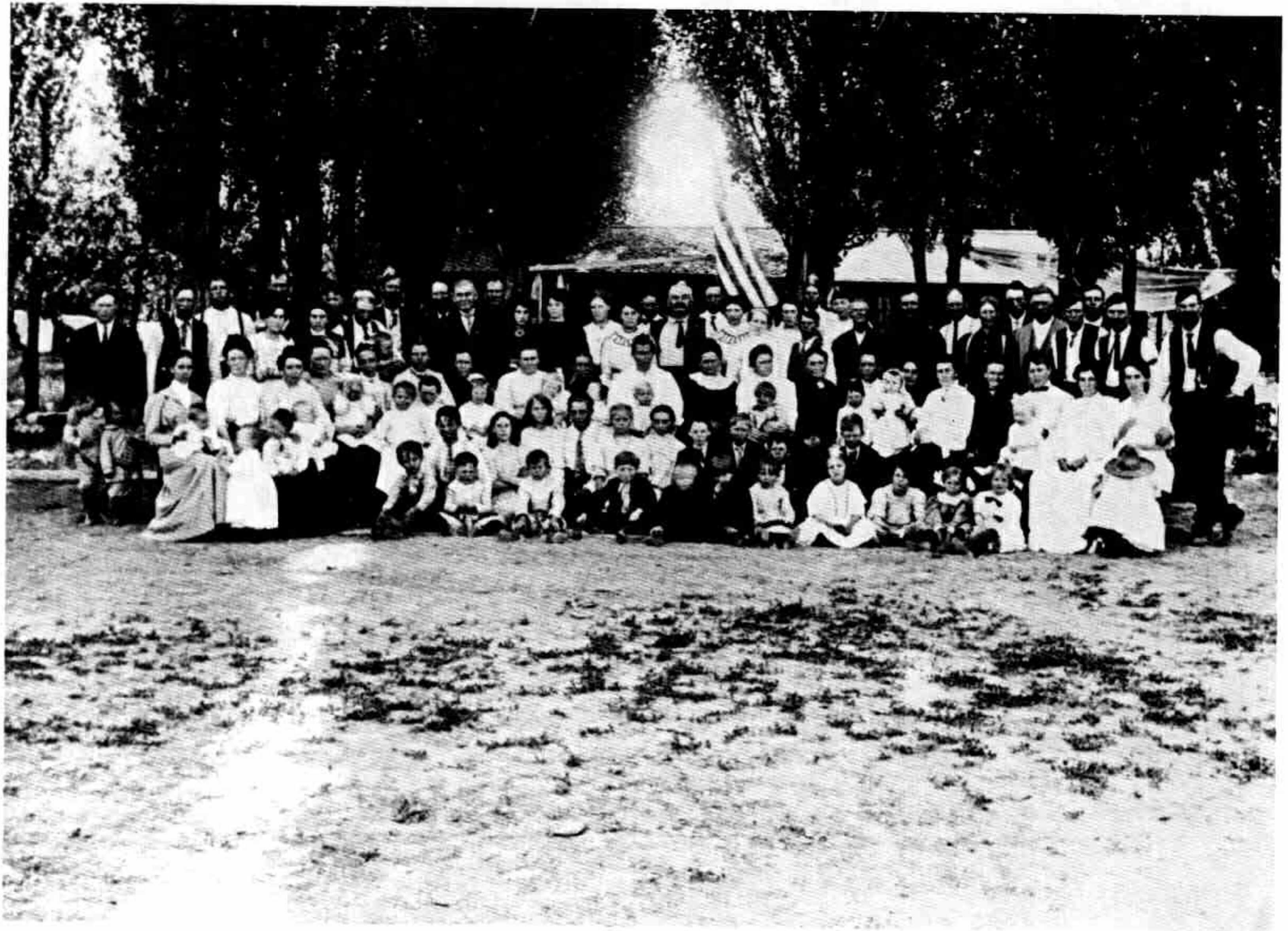
A Priest Reunion